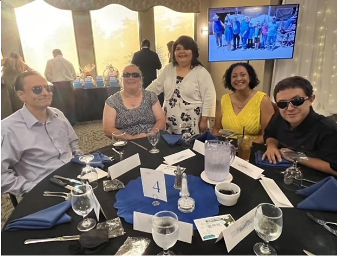
Community Center for the Blind and Visually Impaired September 30 • 📍

CCBVI celebrated its 75th year as a nonprofit on Saturday night at Elkhorn Grill & Banquets-- fabulous people, delectable food, amazing speakers, presentations, incredible silent auction and raffle items, dancing, and Special Occasions Photo Booth LLC to capture the memories. CCBVI is grateful for the community support. Here's to the next 75 years of providing specialized services to those whose vision impairments impede their ability to perform tasks of daily living. Thank you! #CCBVI #75YearsStrong #Nonprofit #Gala #Stockton #ElkhornGolfClub