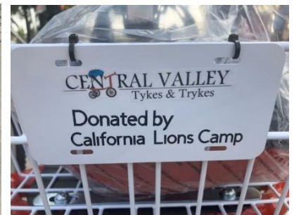
Personalized plates were affixed to donated bikes.