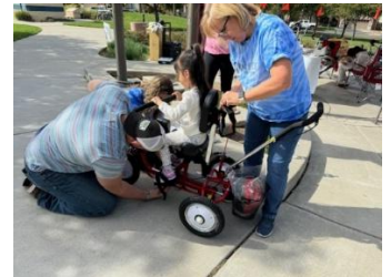
Adjustments were made to these bikes.