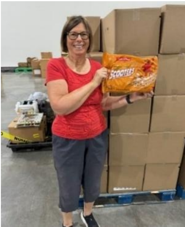
Lion Debbi picked up four pallets of donated cereal for Brighter Christmas.