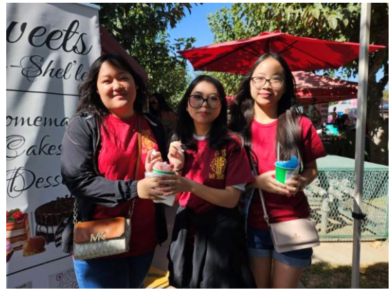
NUT FESTIVAL 2024