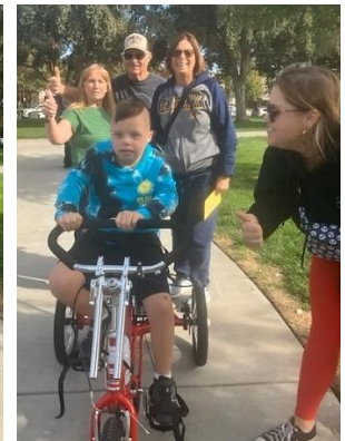
Left photo: Dad brought his daughter for a first meeting so that an adaptive bike could be ordered just for her. Right photo: Thumbs up! It's a perfect fit!