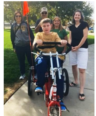
After patiently waiting, the students now had their bikes.