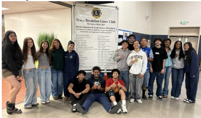
Tracy Breakfast Lions served 301 pancake breakfast to the senior class at West High School.